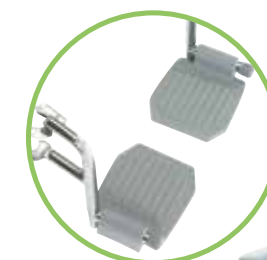
SMT006L REPLACEMENT FOOTRESTS